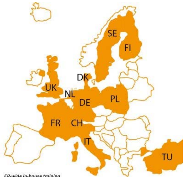
EP-wide in-house training

Those who desire to establish basic knowledge in intellectual property (such as trainee patent attorneys, IP coordinators, but also inventors) we recommend following our 3-day Patent Tutorial . A detailed brochure can be downloaded from www.deltapatents.com .