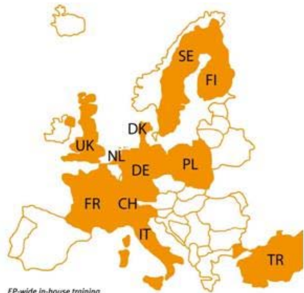
EP-wide in-house training

Please use the enclosed registration form to enrol and send it to us by email or fax. You may also register online: www.deltapatents.com .