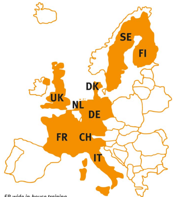
EP-wide in-house training

Please check our website ( www.deltapatents.com ) for our cancellation policy.