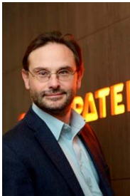
Pete Pollard Salted Patent